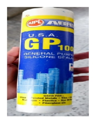
Fig. 1. A.I.P.L U.S.A. G. P. 100 silicon sealant.