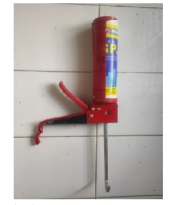
Fig. 2. Gun with silicon sealant.

The presence of apical bronchus at the right side (Fig. 3 and 4) which ventilates the apical lobe of right lung was the most important feature of the lung of ruminants which is better understood with the help of this specimen. The bronchial tree pattern and extra pulmonary vascularization cast has been prepared in pigs (Michael et al. , 2005).