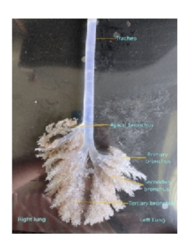
Fig. 4. Silicon cast of tracheo-bronchial tree of Barbari goat (Dorsal view.